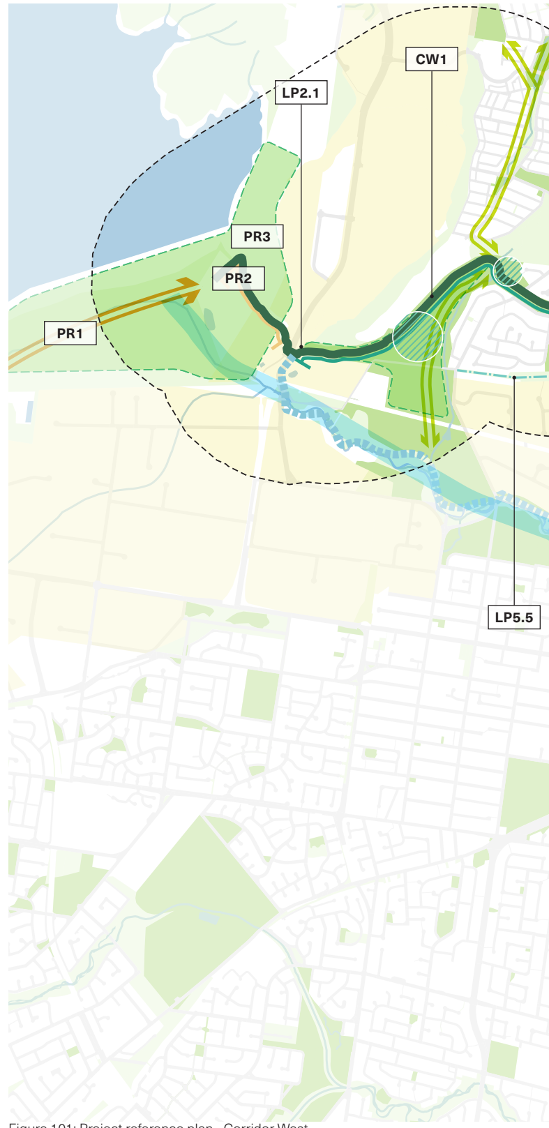
Figure 101: Project reference plan - Corridor West