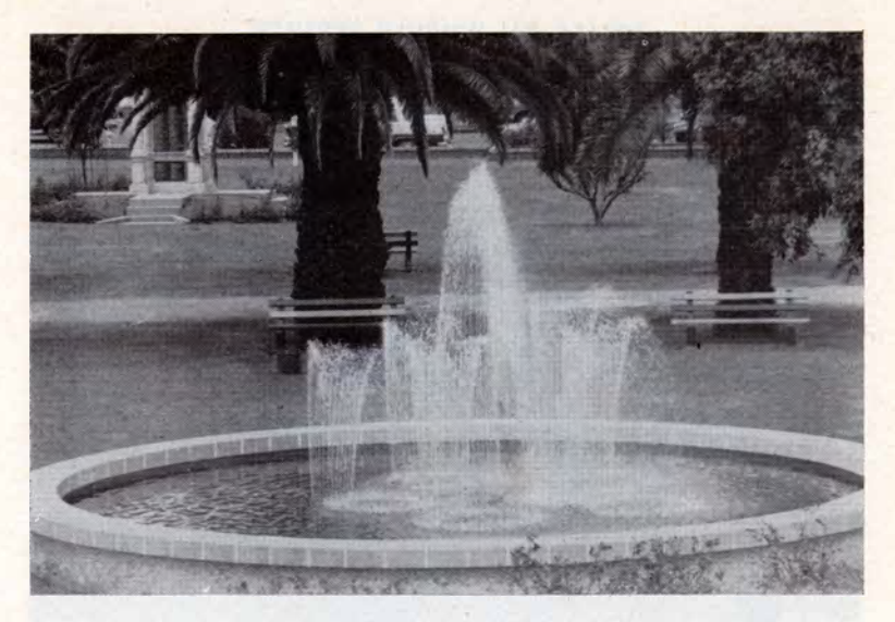
Ornamental Fountain - Wellington Park.