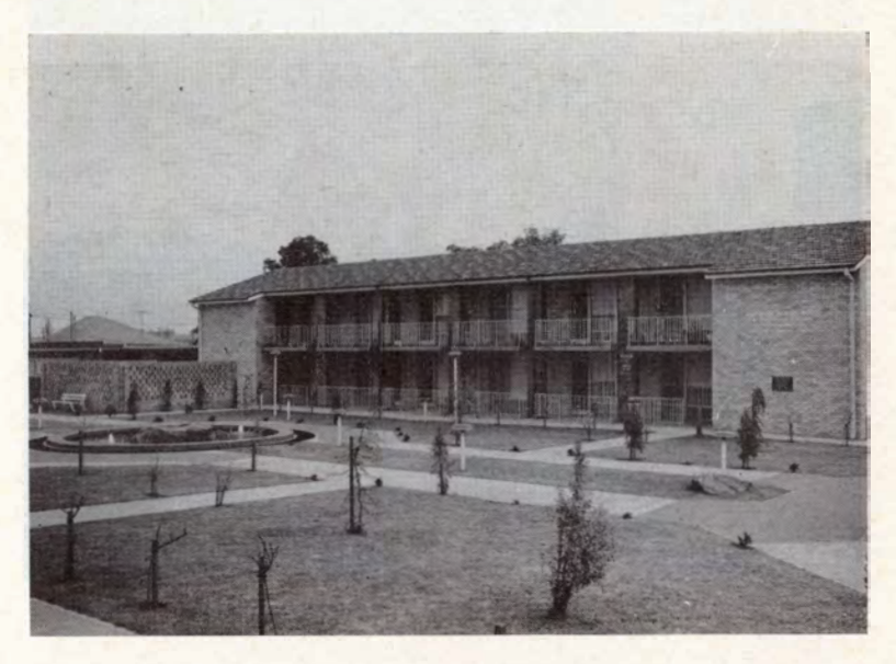
Western wing of the Senior Citizens' Units featuring lawn area and ornamental pond.