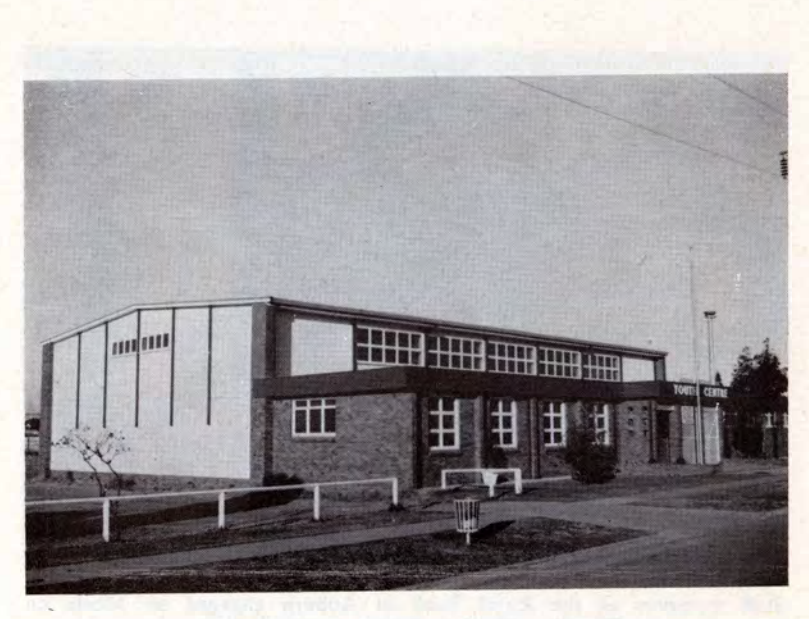
Auburn-Lidcombe R.S.L. Youth Club Centre