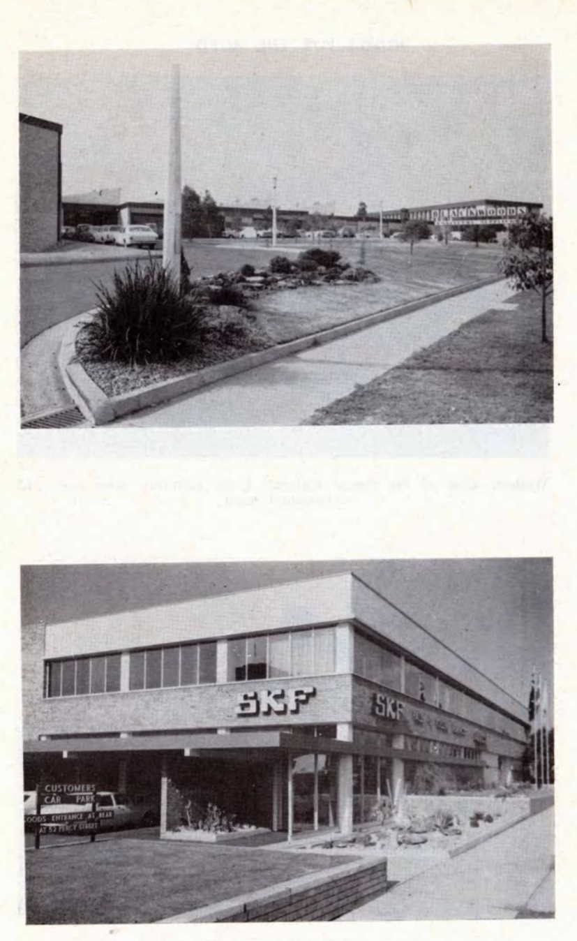
Recent Industrial Development