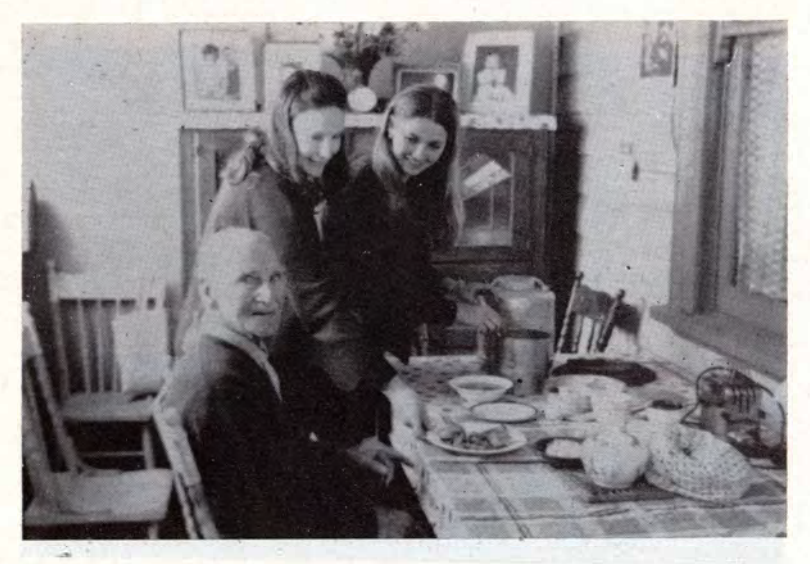
Staff members of the Rural Bank at Auburn engaged on Meals on Wheels activities during personal time.