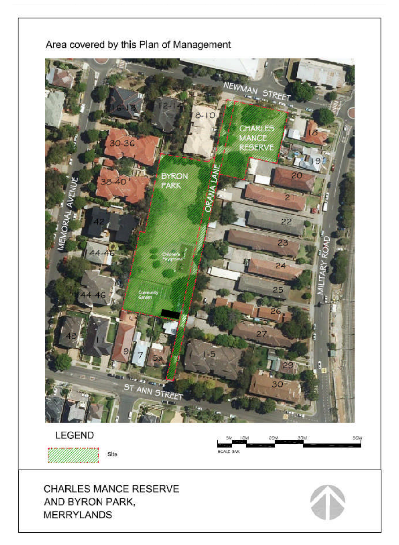
Figure 2 Area covered by this Plan of Management