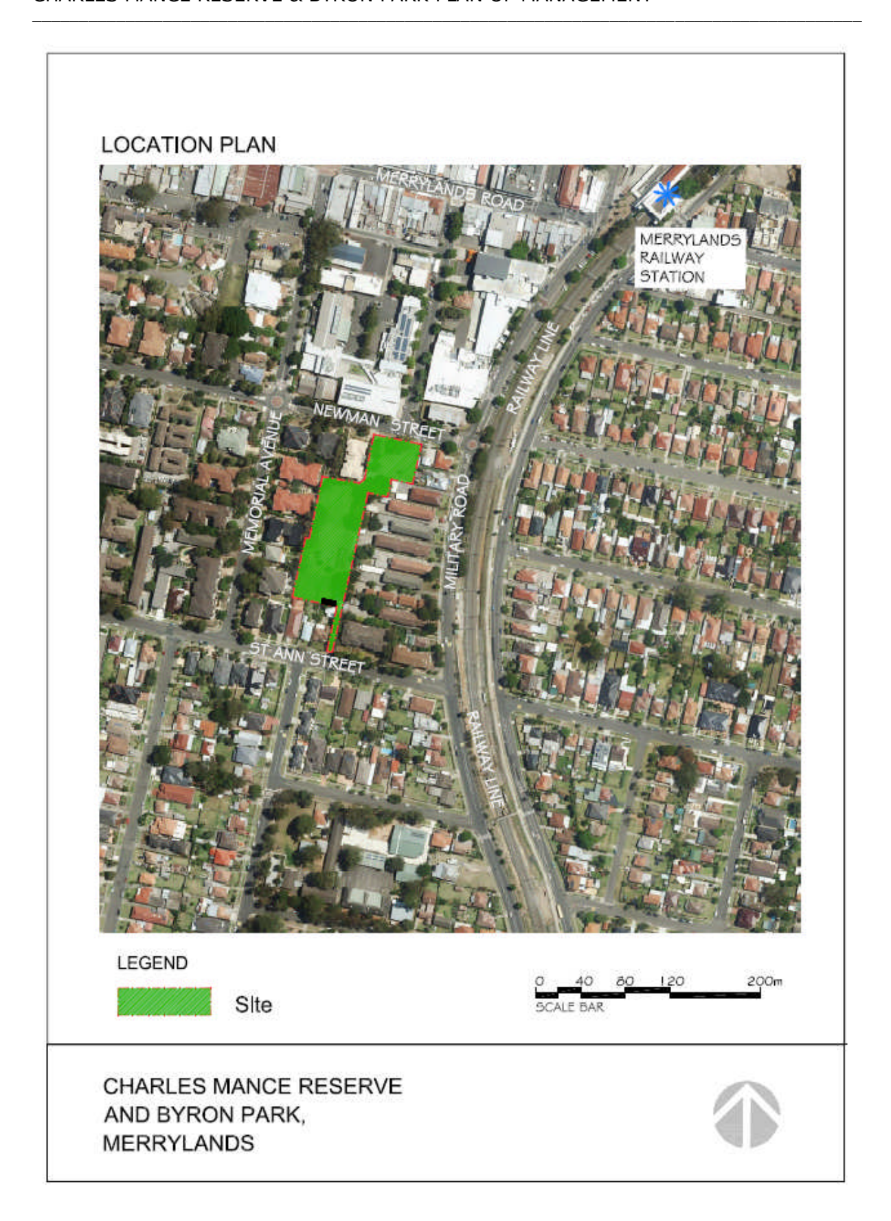
Figure 1 Location of Land.