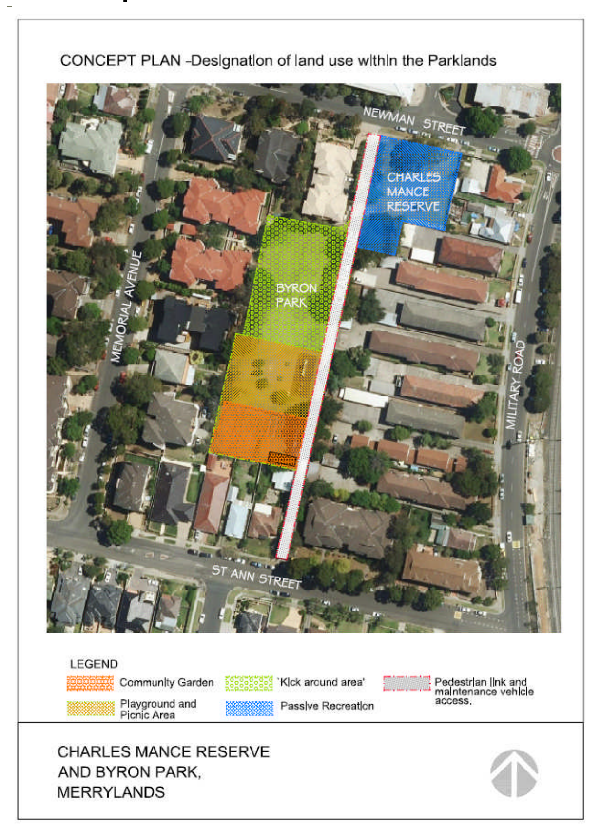
Figure 3. Concept Plan