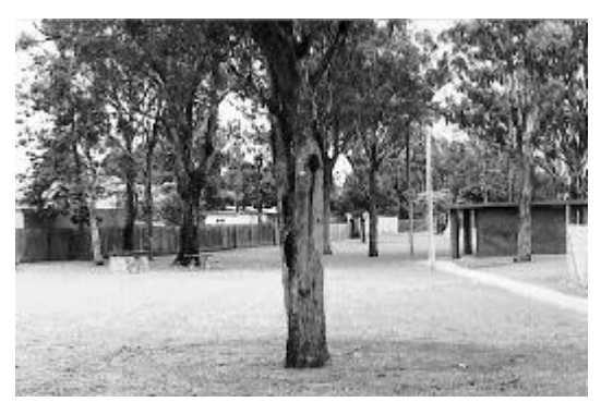
Remnant trees in Girraween Park in Toongabbie

These resources are under threat of being lost through a combination of factors including: