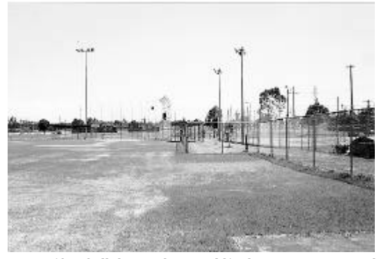
View of baseball diamond on Guildford West Sportsground