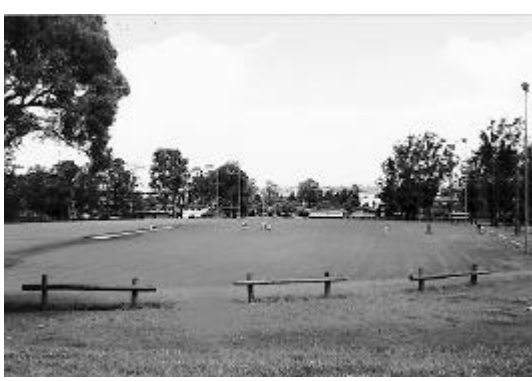
Nemesia Street Park in Greystanes

The main objective of this Plan of Management (POM) is to guide the future management and development of the various Sportsgrounds listed in the Schedule and located throughout the Holroyd City Council Local Government Area (LGA), taking account of community expectations and the resources available to Council.