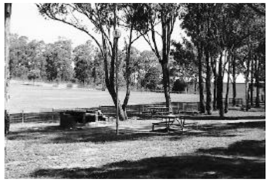
Picnic and BBQ facilities at Alpha Street Park in Greystanes