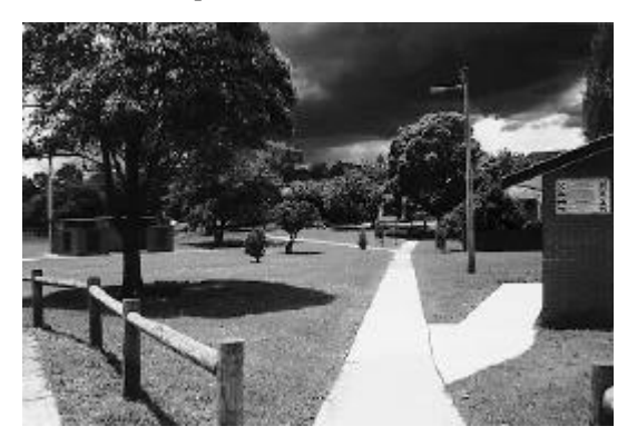
Pedestrian access through M.J. Bennett Sportsground

inadequate access and facilities for disabled persons