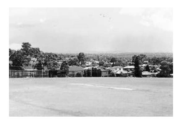
Typical Sportsground facility in Holroyd LGA

This document was placed on public display for a period of 42 days to provide interested parties with an opportunity to comment on the Draft Plan of Management. Comments received were considered by Council and the final document adopted without amendments being required.