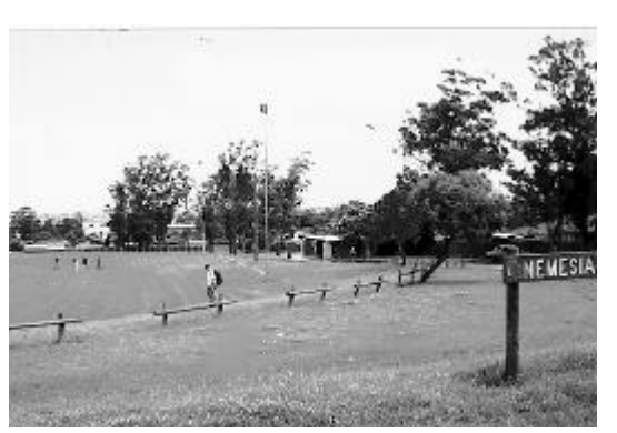
Sportsgrounds are used by a variety of user groups

In addition, the Sportsgrounds are used by individuals including adjoining residents for a diverse range of active and passive recreation activities.