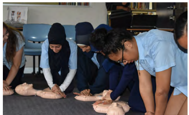
Youth Life Saver Program, Royal Life Saving Society, funded by Wenty Leagues