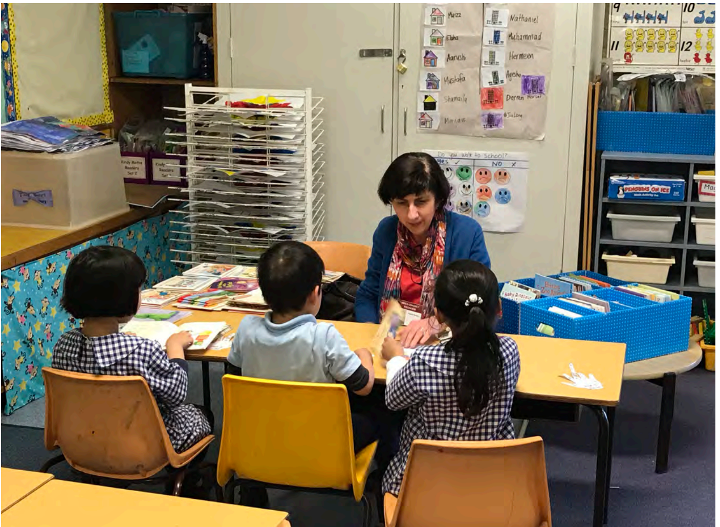
Mercy Connect Sydney, Mercy Works, funded by DOOLEYS Lidcombe Catholic Club & Guildford Leagues Club