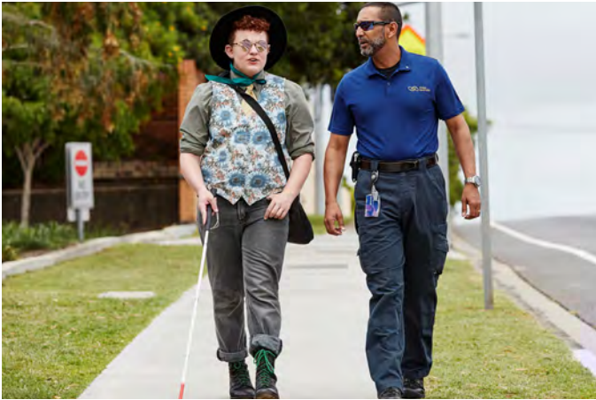
Vision Australia's Orientation and Mobility Program – Vision Australia, funded by DOOLEYS Lidcombe Catholic Club