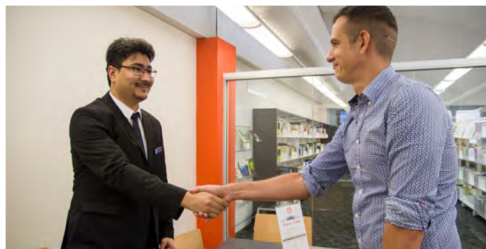
Connect to Work, Auburn Small Community Organisation Network, funded by DOOLEYS Lidcombe Catholic Club