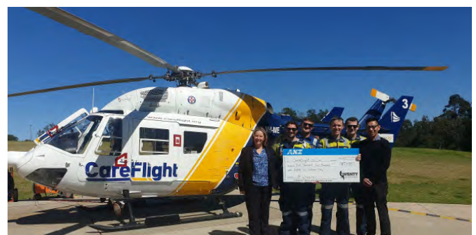
Careflight Rescue for Cumberland, Careflight, funded by Wentley Leagues