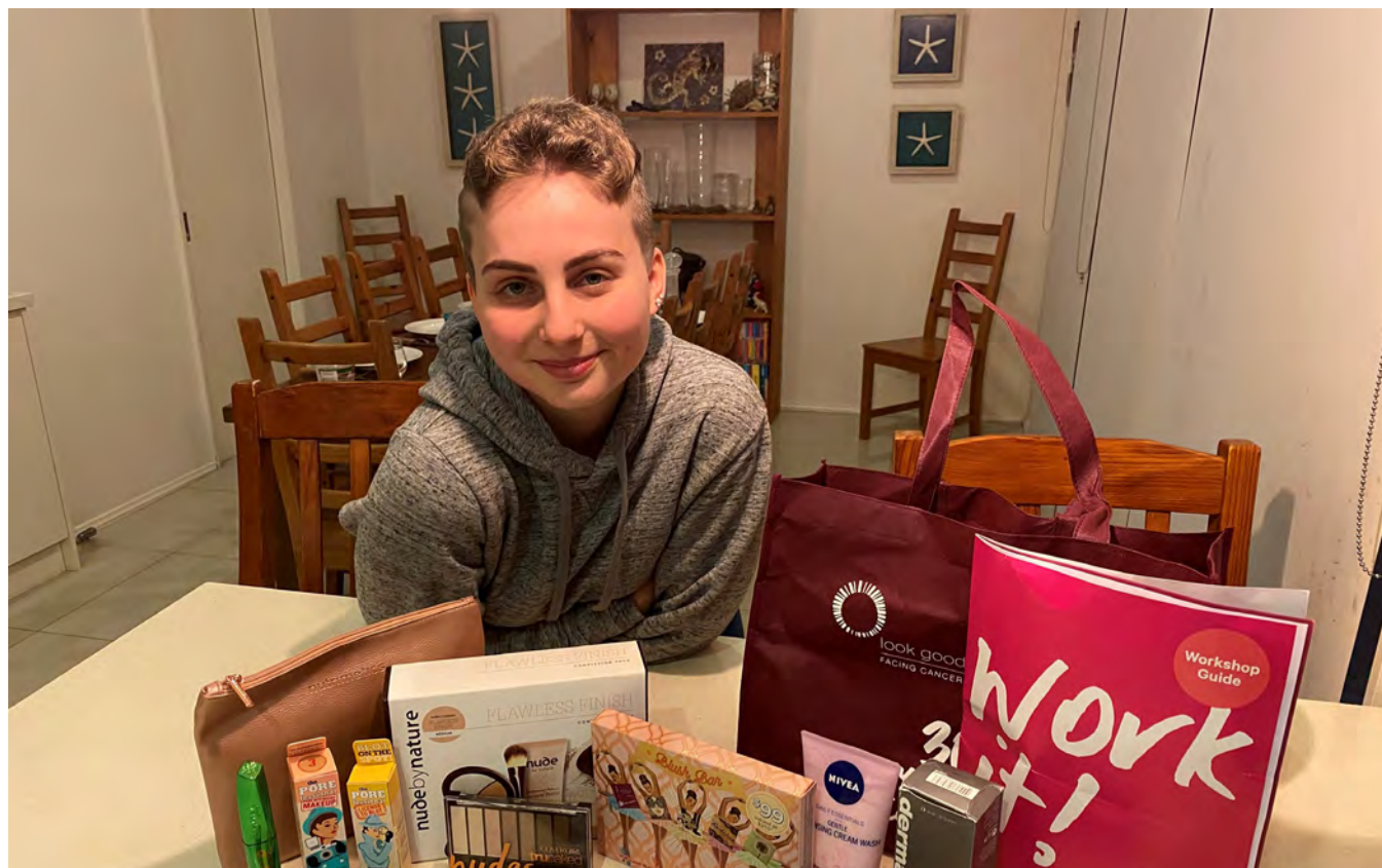
Look Good, Feel good, Cancer Patient Foundation, funded by Guildford Leagues