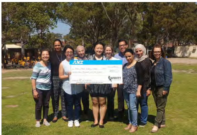
Hilltop Road Community First Aiders Project, Hilltop Road Public School, funded by Wenty Leagues