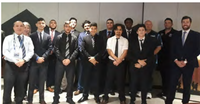
The 21st Century Skills Partnership, The 21st Century Empowerment Project funded by MERRYLANDS RSL CLUB