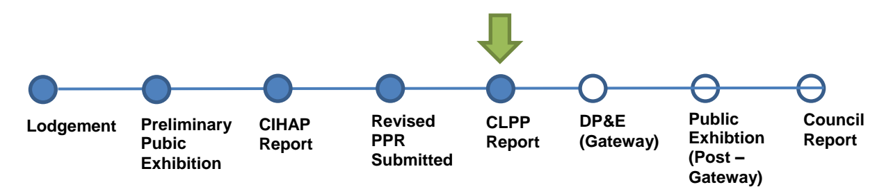
Figure 1: Planning Proposal Status

The status of the planning proposal is outlined in Figure 1.