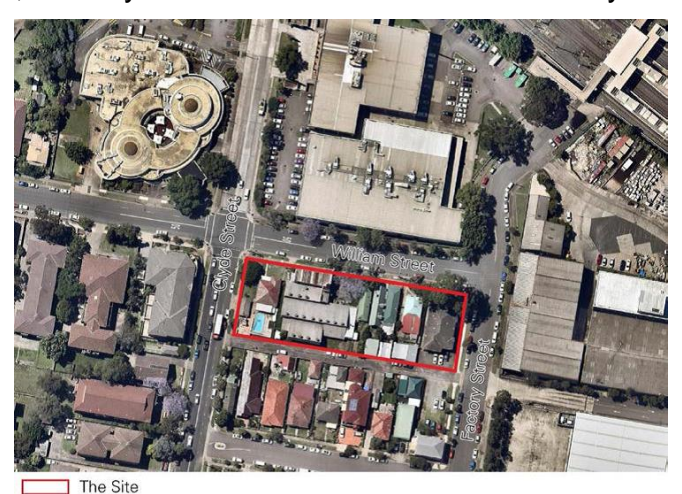
Figure 2: The Site and surrounds

The Site is located on the southern side of William Street, and is bound by William Street, Clyde Street, Factory Street and a rear access laneway.