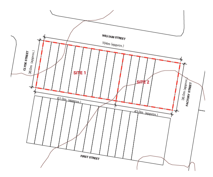
Figure 3: Overall site ownership plan