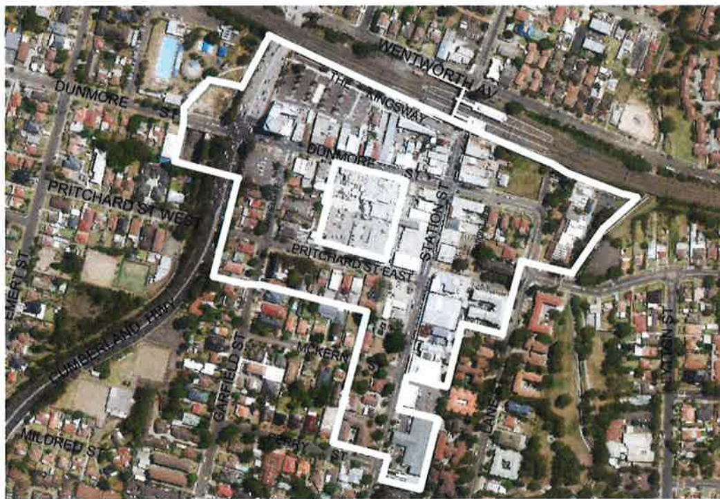
Figure 1- land subject to planning proposal

The planning proposal for consideration will encompass all land within the Wentworthville Centre as shown in Figure 1, with the exception of 42-44 Dunmore Street and 108 Station Street, which are subject to separate planning proposals, both with gateway determinations.