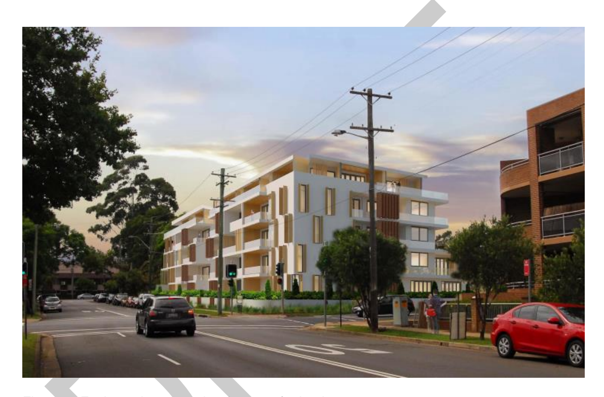
Figure 3- Envisaged concept development for land