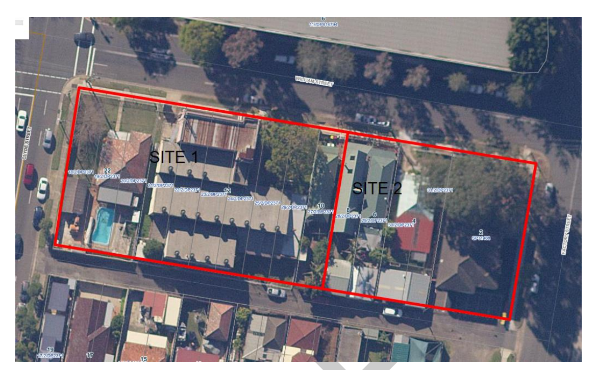
Figure 2- Aerial view of Sites 1 and 2