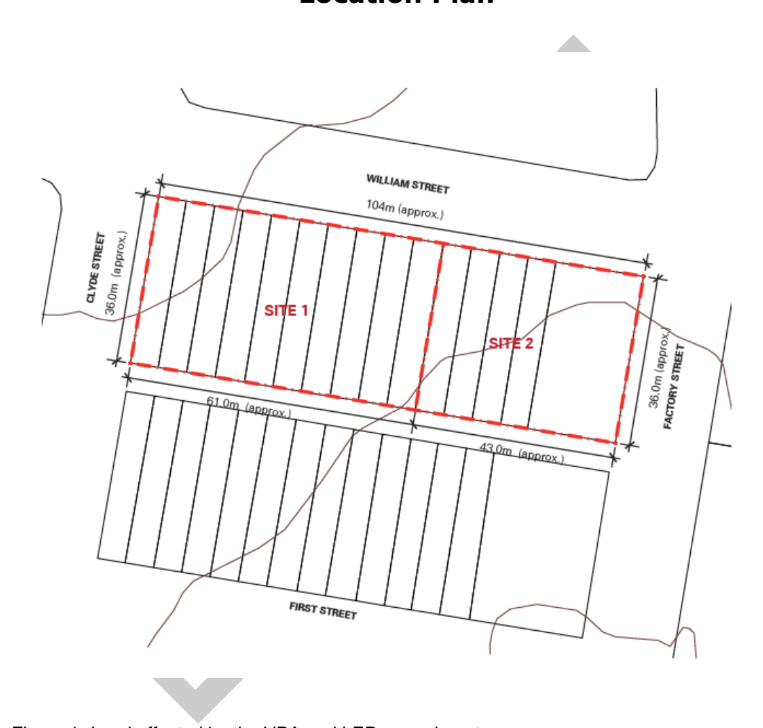
Figure 1- Land affected by the VPA and LEP amendment