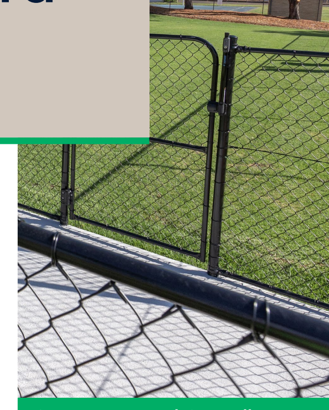
Greystanes Ward Councillors