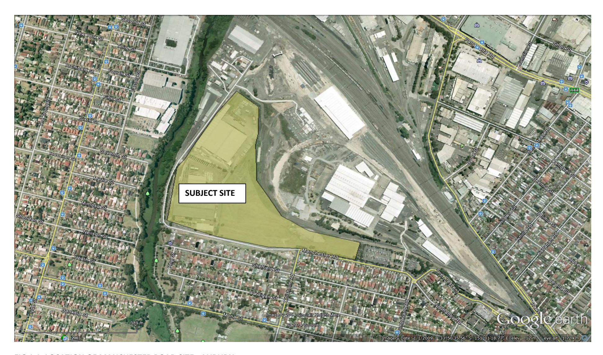
FIG 1.1: LOCATION OF MANCHESTER ROAD SITE - AUBURN