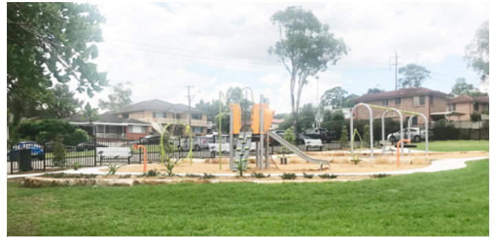
The refurbishment for the playground at Greystanes Sportsground is now complete.

At Cumberland City, we are about investing in assets and infrastructure that our local community can enjoy.