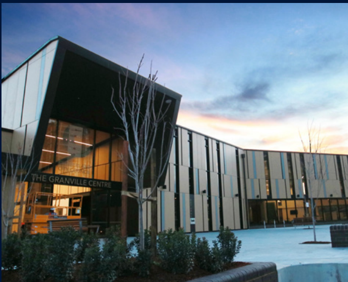
Celebrate the NSW Seniors Festival with an exhibition at The Granville Centre.

To celebrate the NSW Seniors Festival from 13-24 April 2021, Council in partnership with the Department of Communities and Justice will host an exhibition to highlight the value, experiences and contributions of older people, and challenge perceptions of ageing. We will bring you a digital screening of 'The Art of Ageing' for your viewing pleasure. This exhibition celebrates the rich and diverse lives of older people living in NSW.