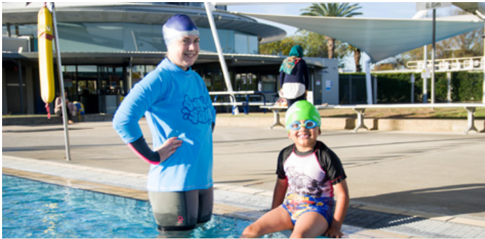
Granville Swimming Centre's amenities will be receiving an upgrade this year.