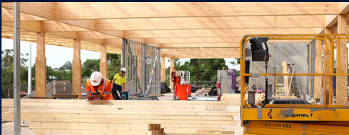
The timber structure of the new stadium is now complete.

Council is planning to name the revamped Granville Stadium after Rugby legend, Eric Tweedale.