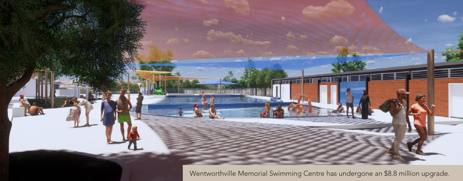
Wentworthville Memorial Swimming Centre has undergone an $8.8 million upgrade.