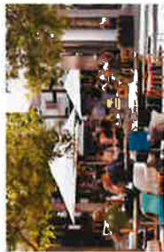
A village green type space is located midway along the site as a pivotal civic space, with focal seasonal tree planting areas, and interpretive features.