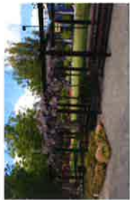
A large open lawn with retained canopy trees has pergola covered walkways, & avenue tree planting to walkways, and series of seating areas.