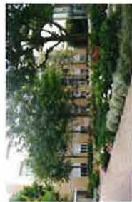
A strong residential character is created along the E/W walkways, with seating nodes, community gardens, and destination pergolas at regular intervals