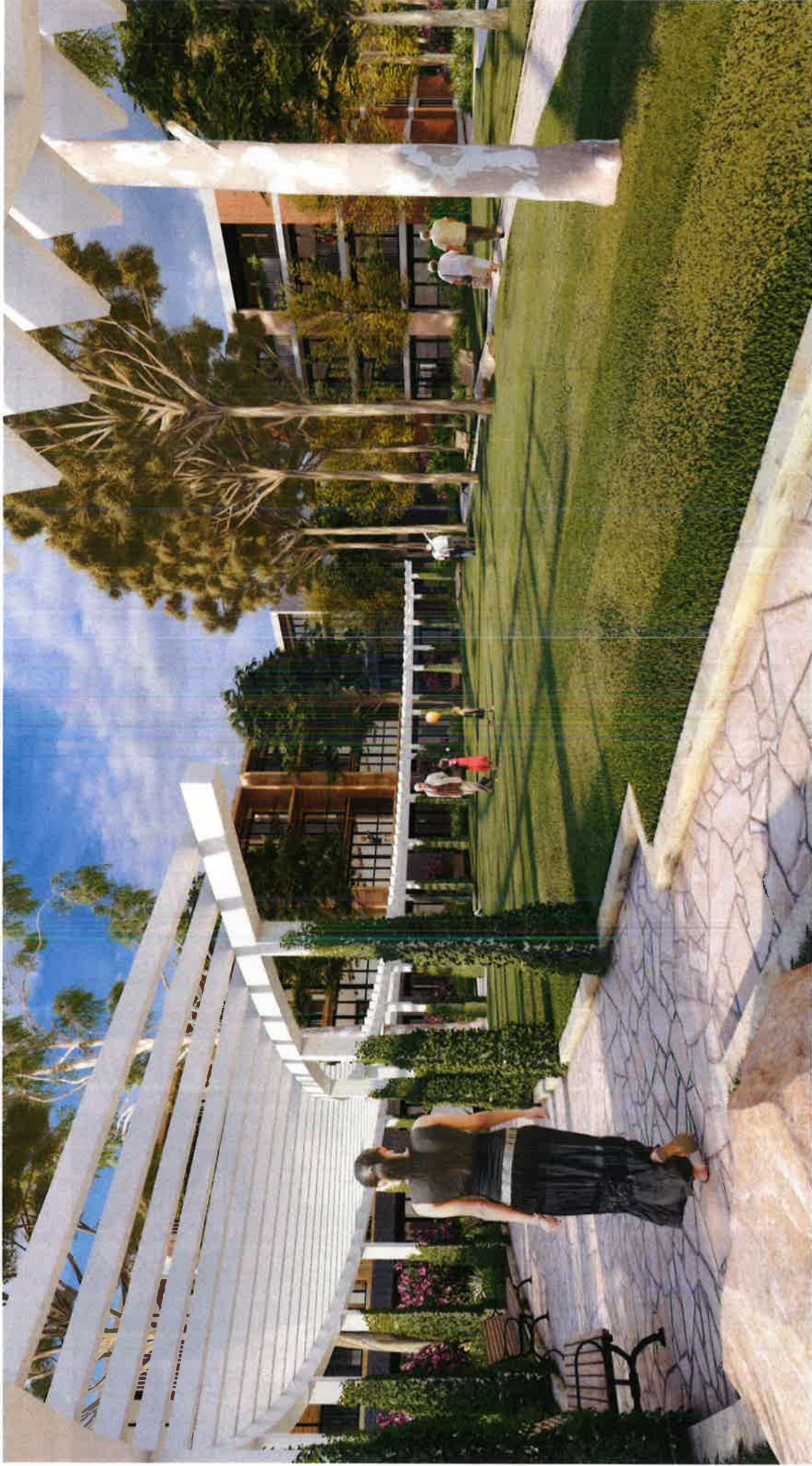
Indicative Landscape Perspective

Open space has been located to retain significant trees identified with the project Arborist, and to create an inviting series of connective spaces, Connective and inviting parks, civic links and walkways create north south through site links, and east-west connections as shown on the plan.