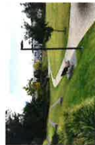
A focal park area has a signature pergolas and walkway, defining a broad lawn, with large existing trees retained and provided a generous visual setting.