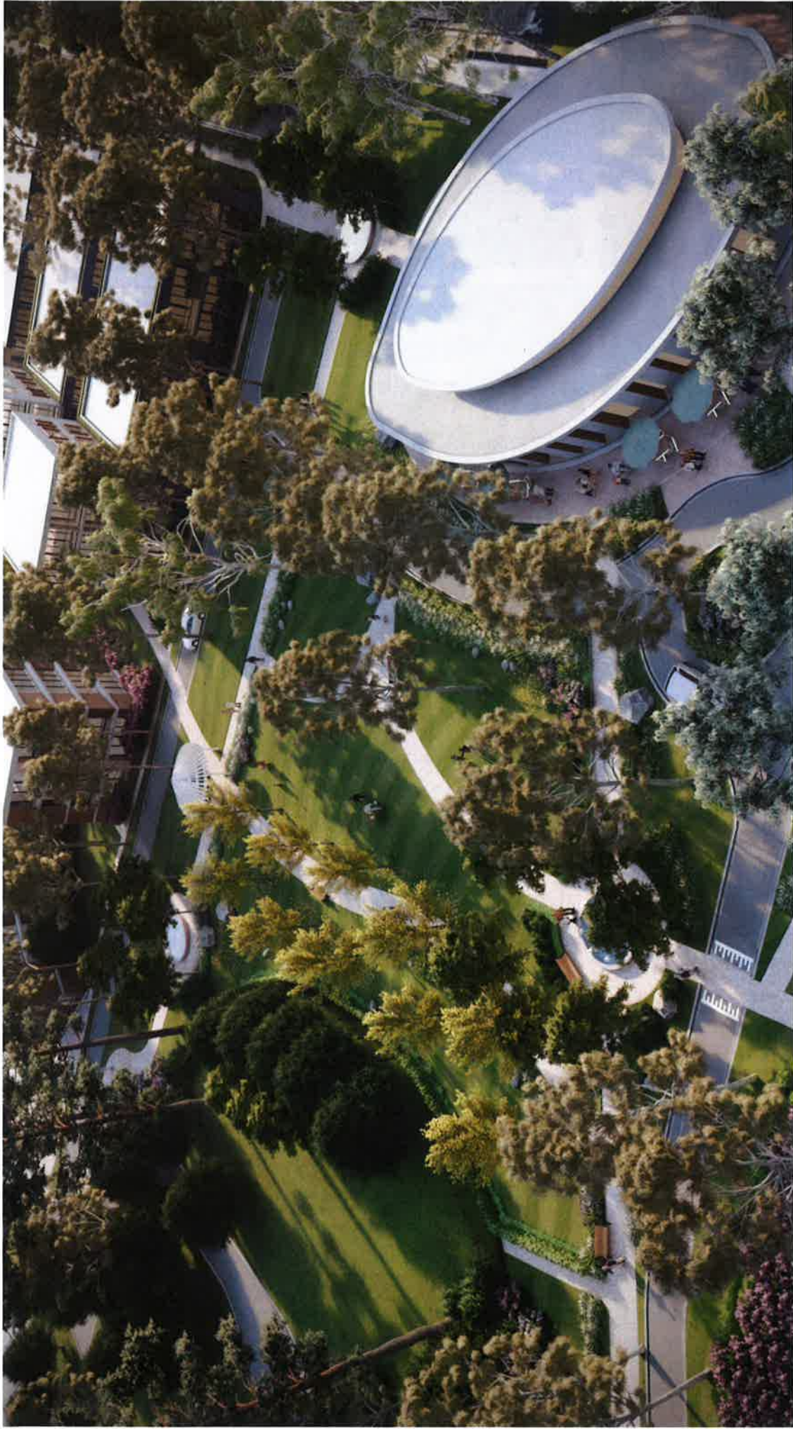
Indicative Landscape Perspective

Within the central precinct a large park is proposed for the benefit of all CGV residents and the public. The CGV community building is located opposite the Sherwood Scrubs heritage building and it's generous lawn - together creating a substantial landscape open space.