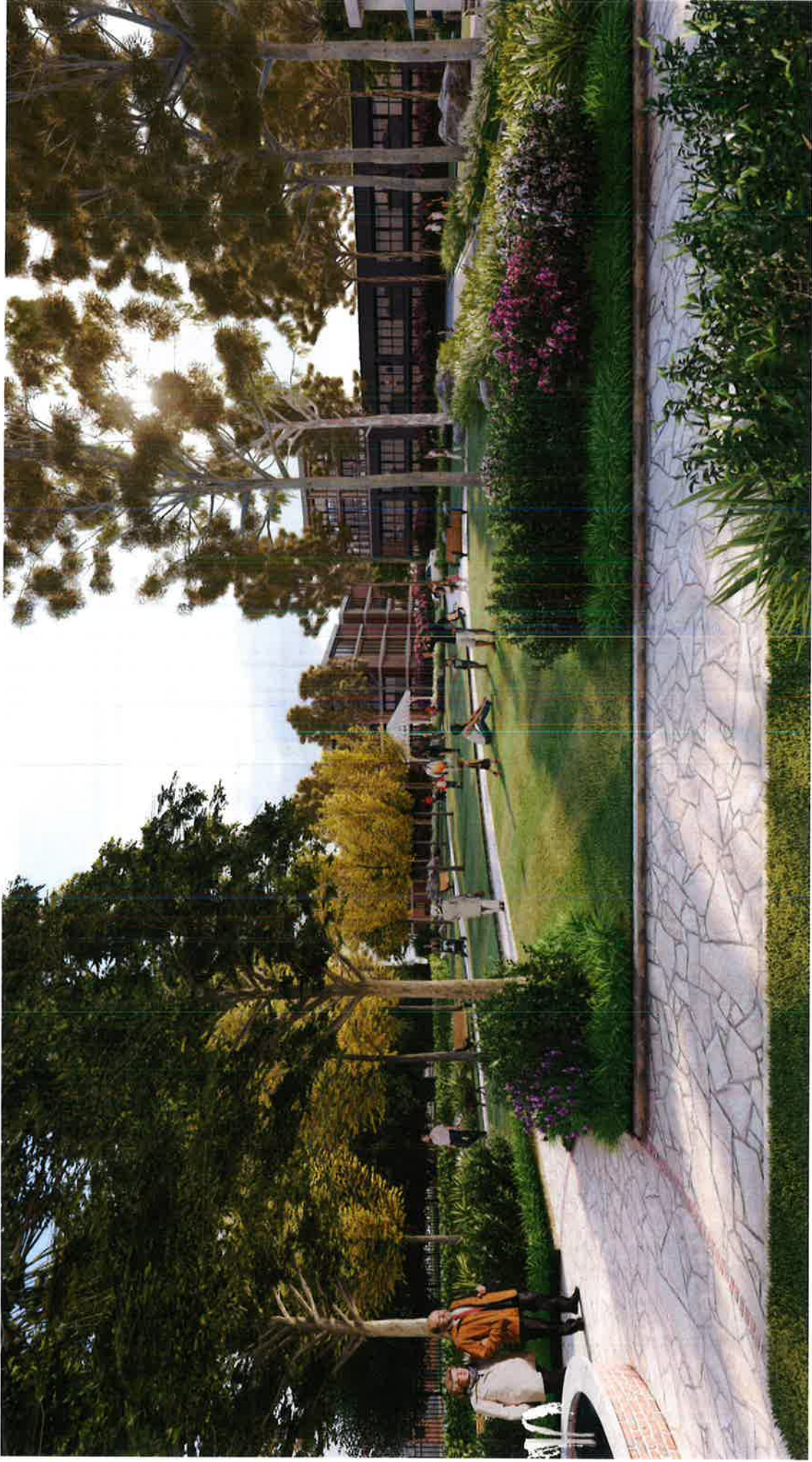
Indicative Landscape Perspective

The connective walkways and series of open spaces invite the community into the site, celebrating social engagement that can contribute significantly to the amenity and integration of the local area. Existing trees will provide an immediate mature landscape identity to the open space.