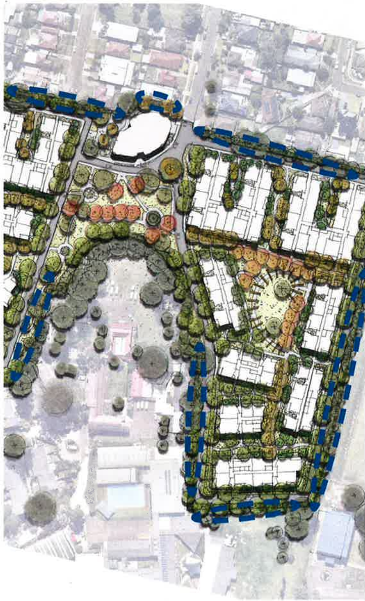
Indicative locations only of typical treatment for boundaries as suitable