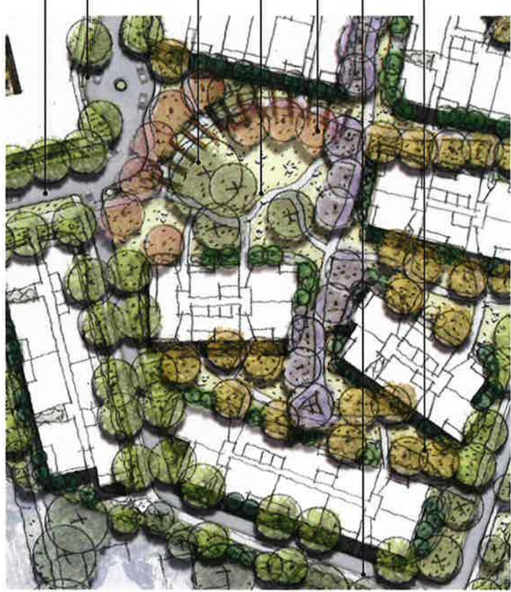
Entry road and allied pedestrian walkway.

A series of parkland areas are provided to the north, centre and southern precincts of the site, with this northern park area having large retained canopy trees that will provide shade and immediate scale to the landscape. The sinuous north-south pathway creates the main civic walkway linking all three precincts, passing through the series of parkland areas and crossing the east-west walkways to each of the residential precincts. A sequence of curved pergola covered walkways define a secondary path as adjunct to the primary path, with a retained trees providing significant landscape scale. Large community gardens allow for creation of garden clubs and wide participation in the social activity of growing vegetables and fruiting trees. Colourful flowering trees provide accents along the lush east-west residential access walkways, that in turn connect to loop walkways around the buildings and roads.