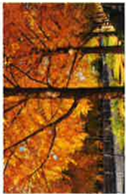
Avenue tree planting flanks the site entry road from the existing roundabout, with a separate pedestrian walkway with feature planting.