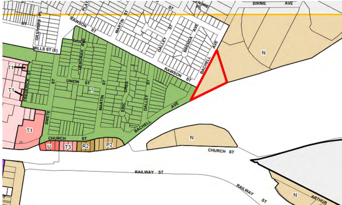
Figure 2: The Site and Floor Space Ratio Controls

The site has a floor space ratio control of 1:1, as shown in Figure 2.