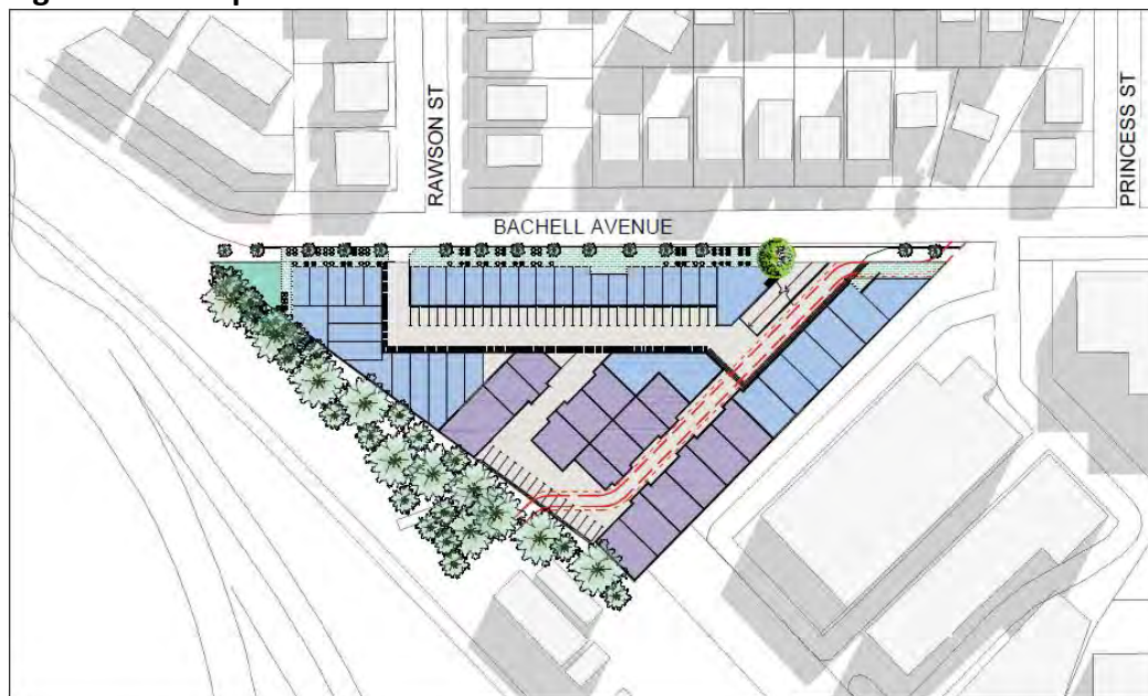
Figure 3: Concept Site Plan

Source: Michael Raad Architects, Proposed Development Concept Design, 2 Bachell Avenue, Lidcombe, 14 August 2018