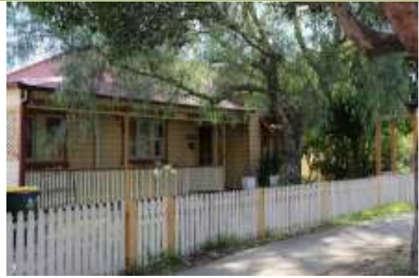
Front façade, fence and gate.