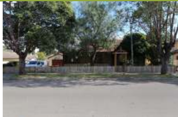
View from Tungarra Road.