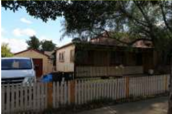
View of southern elevation, carport and fence.