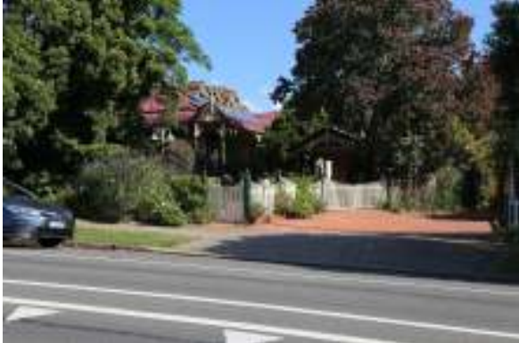
View of dwelling from Targo Road.