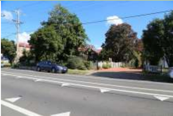
View of dwelling from Targo Road.