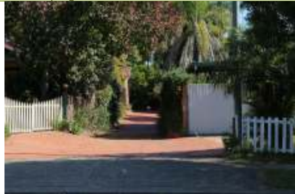
View of driveway and fence.