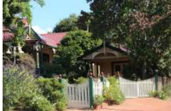
Detail of front façade, carport, fence and landscaping.