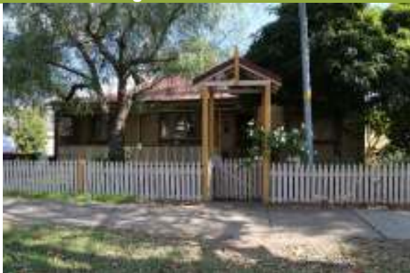
Front façade, fence and gate.