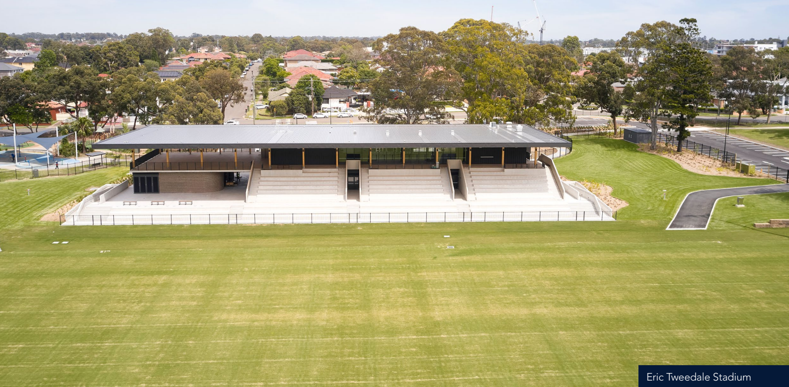
Eric Tweedale Stadium