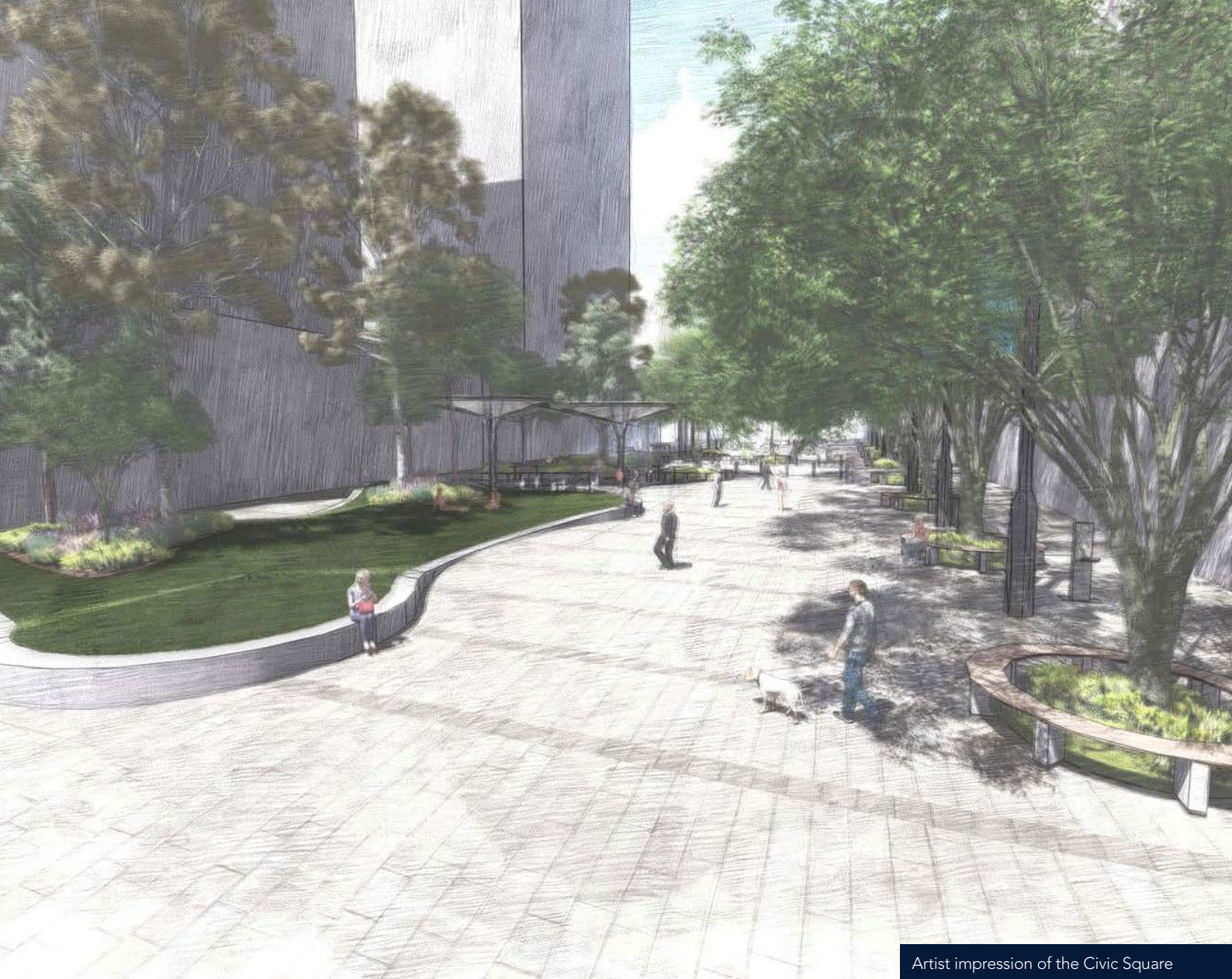
Artist impression of the Civic Square