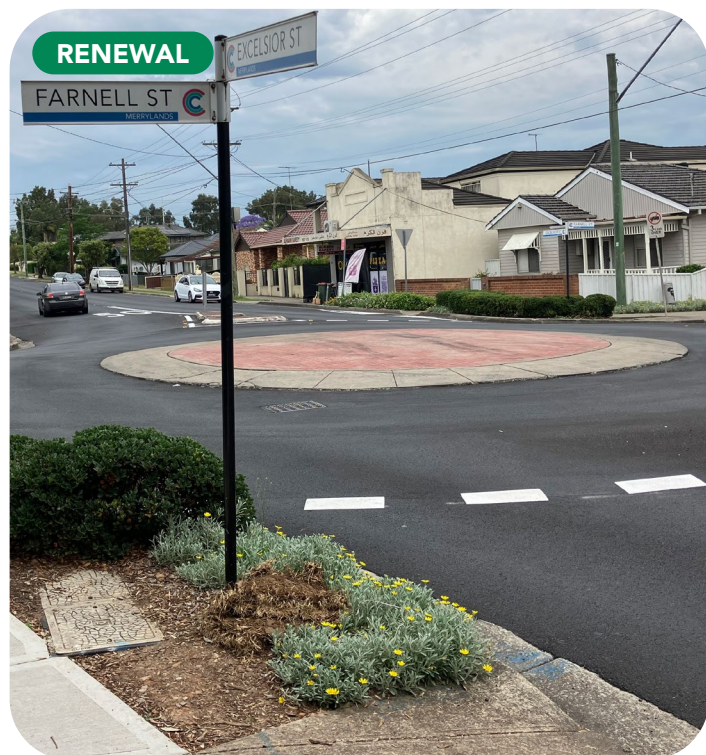
Excelsior Street, Guildford