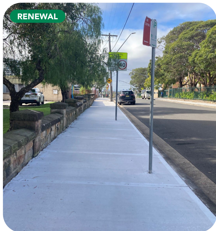
Mary Street, Granville