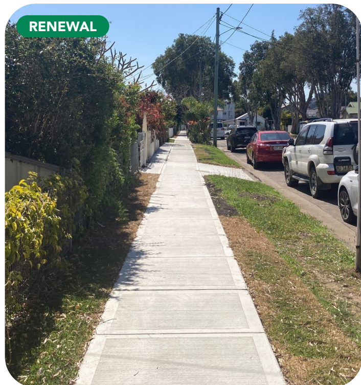
Gregory Street, Granville