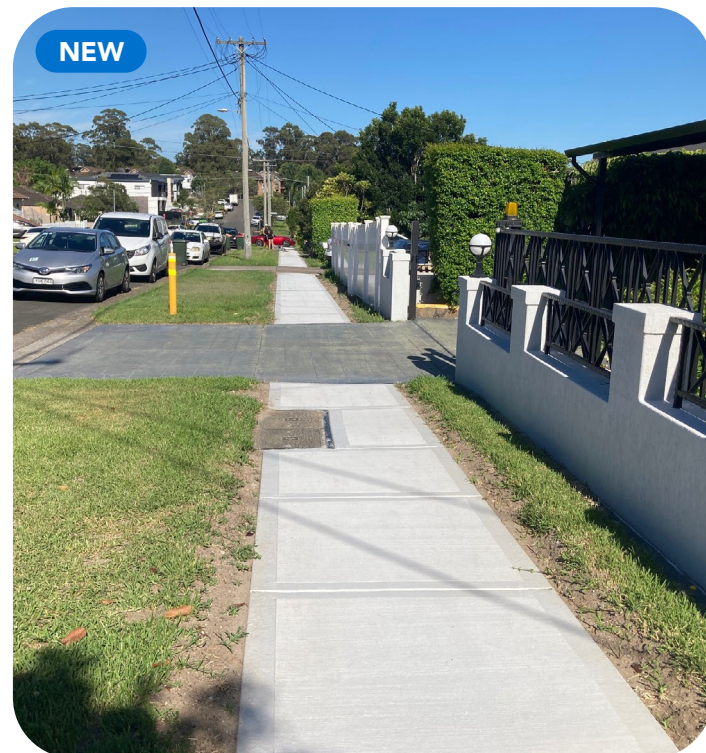
Warialda Street, Merrylands West