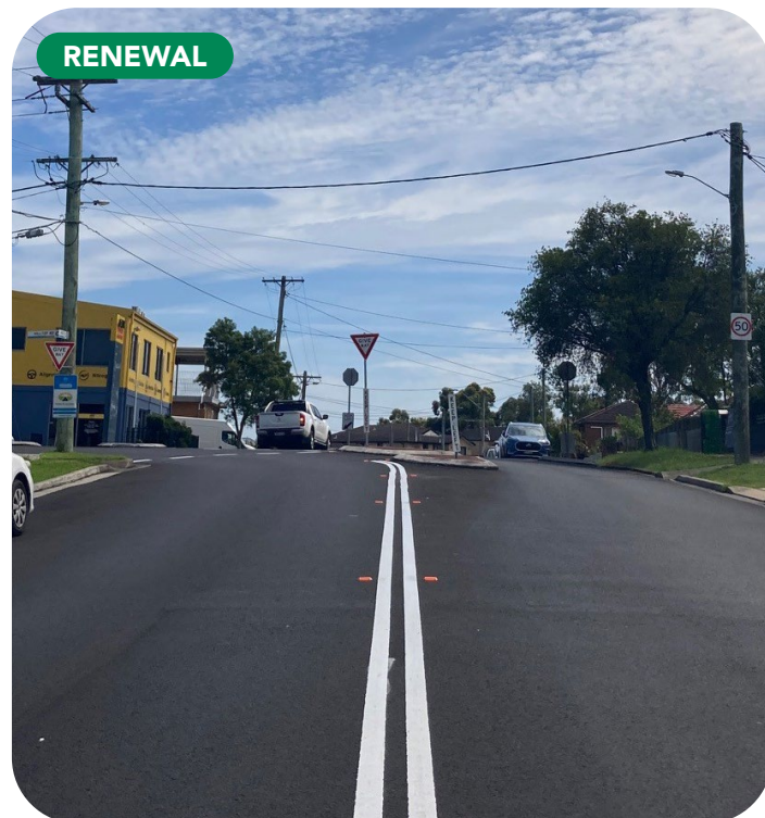
Clarence Street, Merrylands