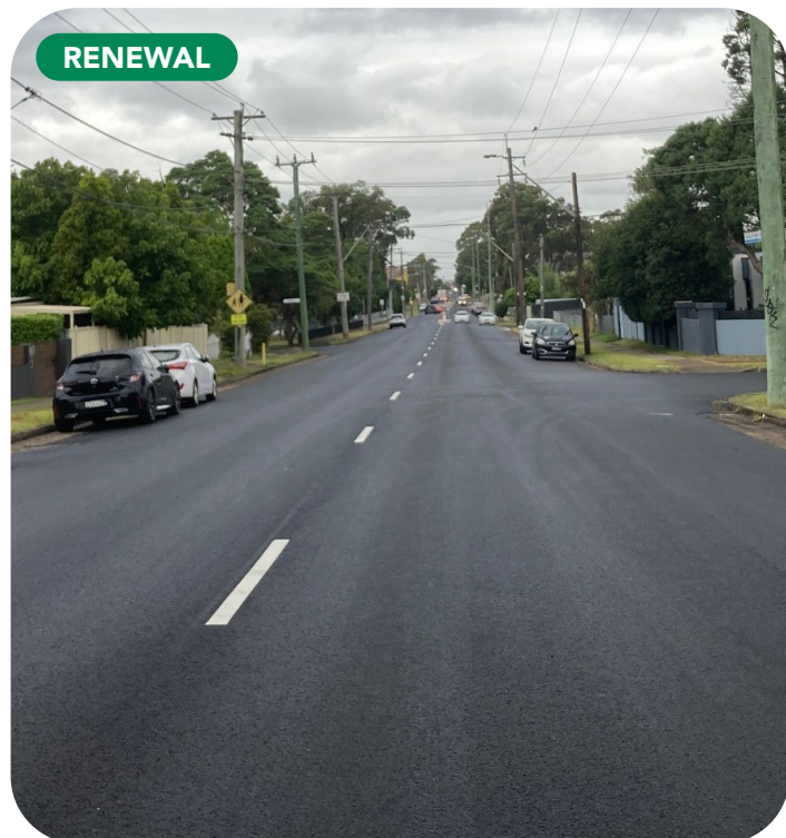
Guildford Road, Guildford