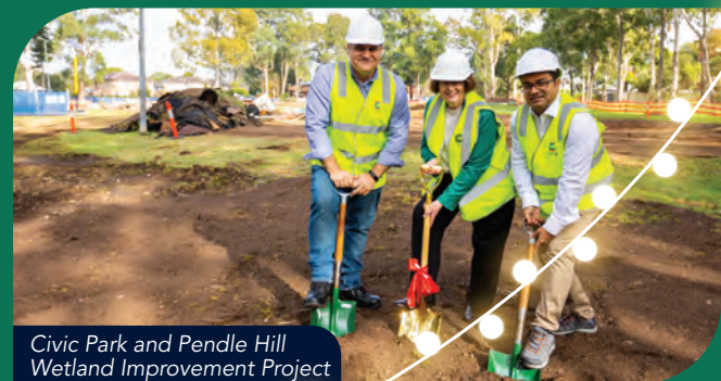
Civic Park and Pendle Hill Wetland Improvement Project