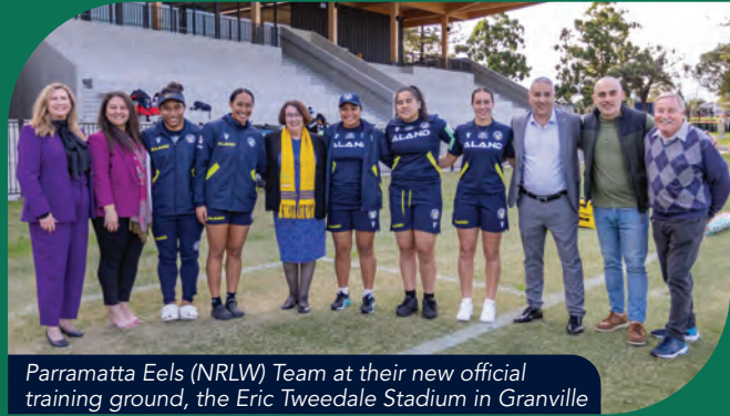
Parramatta Eels (NRLW) Team at their new official training ground, the Eric Tweedale Stadium in Granville