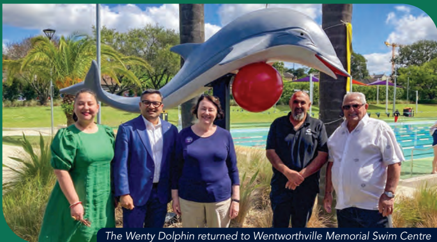
The Wenty Dolphin returned to Wentworthville Memorial Swim Centre