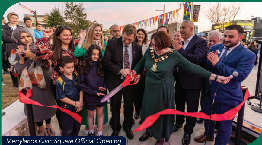
Merrylands Civic Square Official Opening

Stay safe over the holidays and I look forward to seeing you all in 2024.