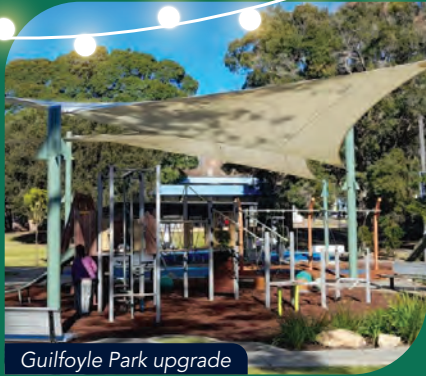
Guilfoyle Park upgrade