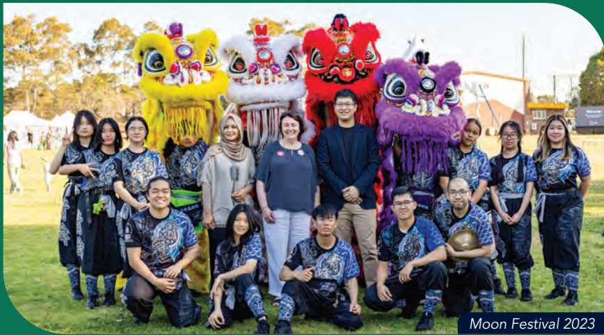
Moon Festival 2023