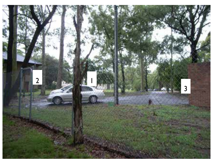
Figure 3: Architectural Features