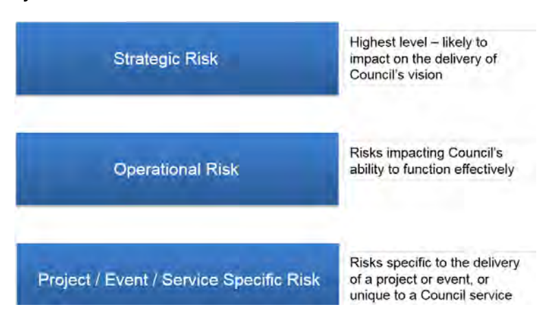
Figure 1: Risk Hierarchy Levels

There are different types of risks within Council. The different risk types are outlined in figure 1 below and should be considered when considering risks: