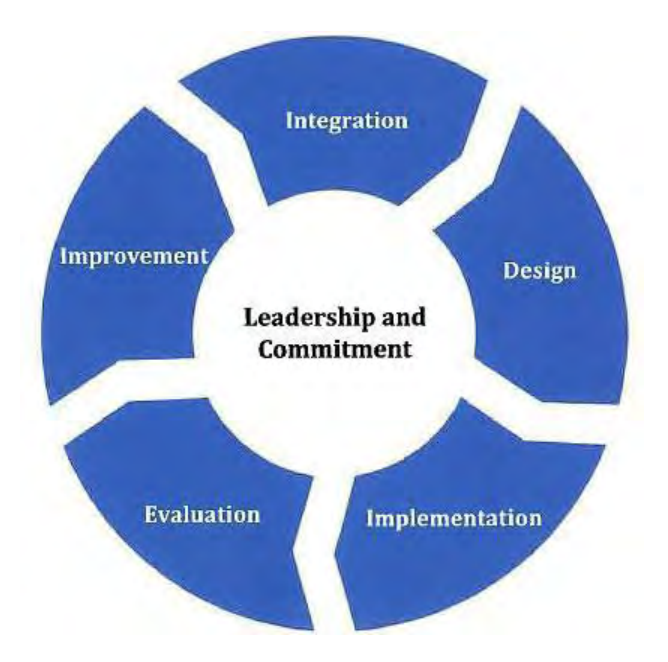
Figure 3 – Leadership Commitment to Risk Management - ISO31000:2018

The success of Council's risk management framework requires the full support of all stakeholders, including the Council, Executive and Leadership team in order to deliver a fully embedded risk framework and positive staff risk culture. This is an integral part of the ISO:31000 Risk Management Framework, as outlined below.