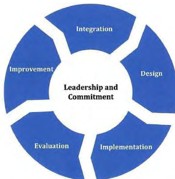
Figure 3 – Leadership Commitment to Risk Management - ISO31000:2018

The success of Council’s risk management framework requires the full support of all stakeholders, including the Council, Executive and Leadership team in order to deliver a fully embedded risk framework and positive staff risk culture. This is an integral part of the ISO:31000 Risk Management Framework, as outlined below.