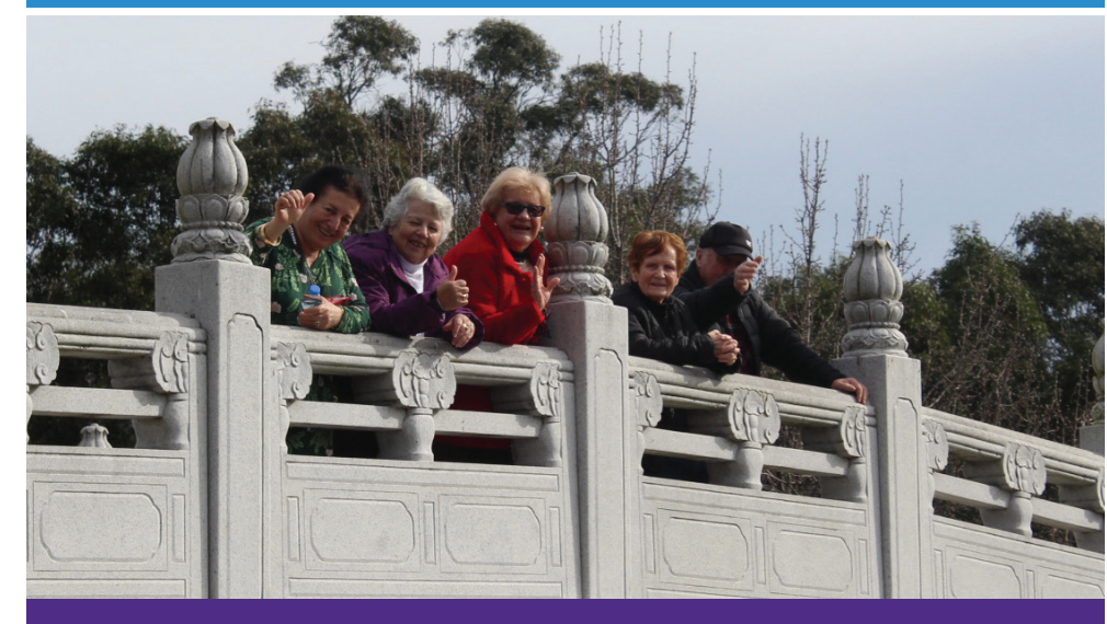
Don't forget to book into our Road Trips and Social Outings.