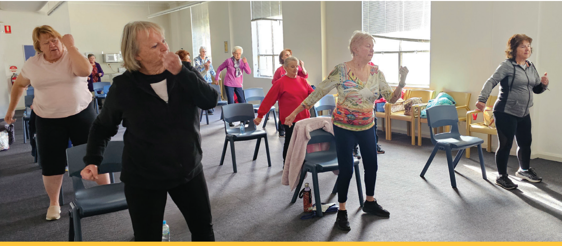
Book into our Over 55's Health Programs for each NSW school term. Locations around Cumberland LGA.