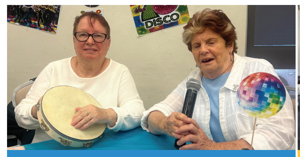
Our Wellness Programs is on Monday's, Tuesday's, Wednesday's and Friday's. Enjoy various activities and a meal.