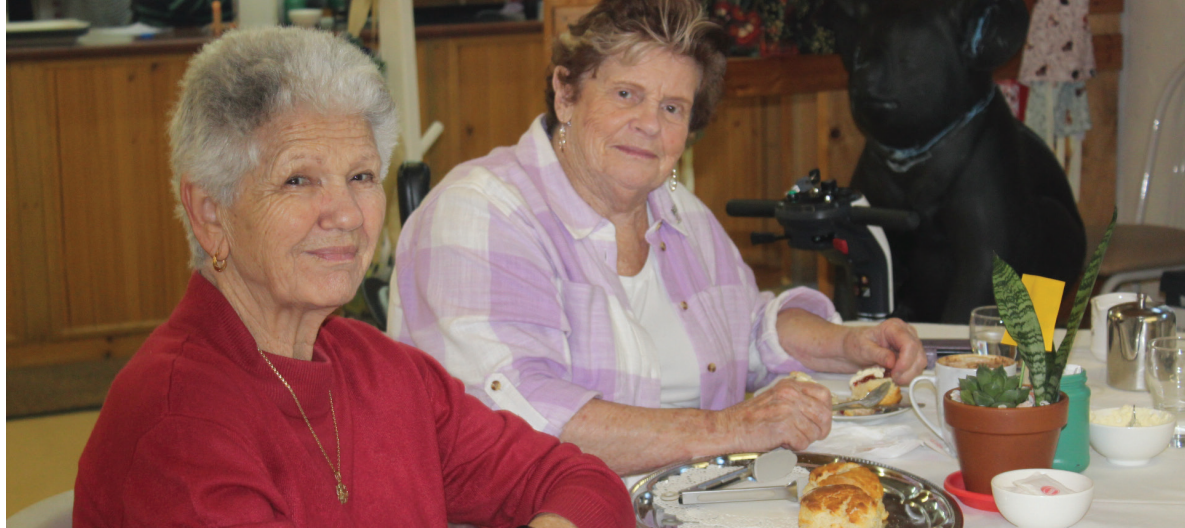
Enjoy a Chatterbox outing with your friends over lunch.

Call our office (02) 8757 9031 we are waiting to hear from you.