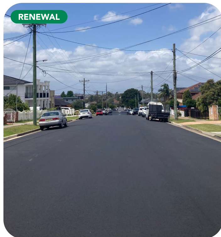
Bright Street, Guildford