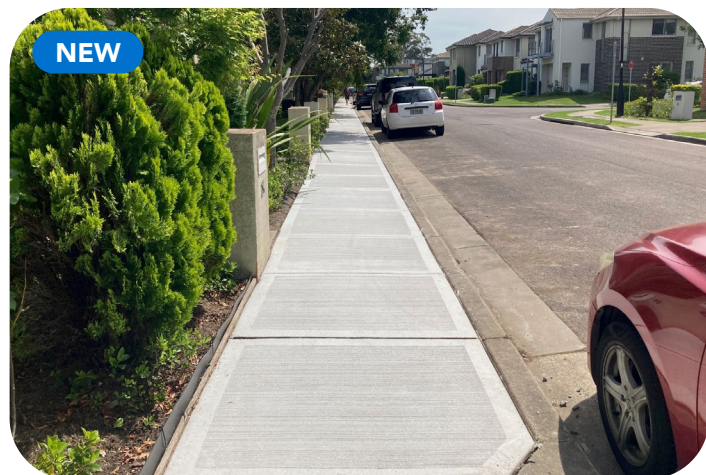
Castle Street, Auburn