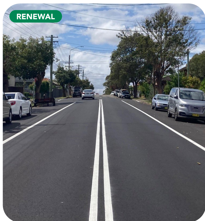
Chiswick Road, Auburn