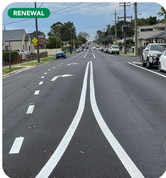
Blaxcell Street, Granville