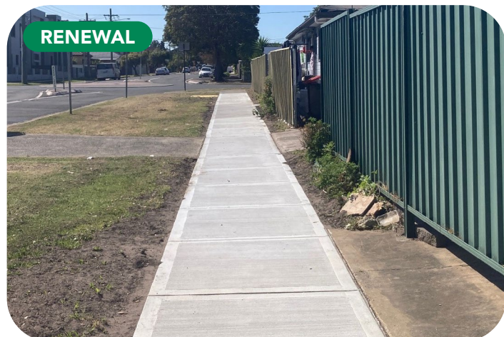
Edgar Street, Auburn