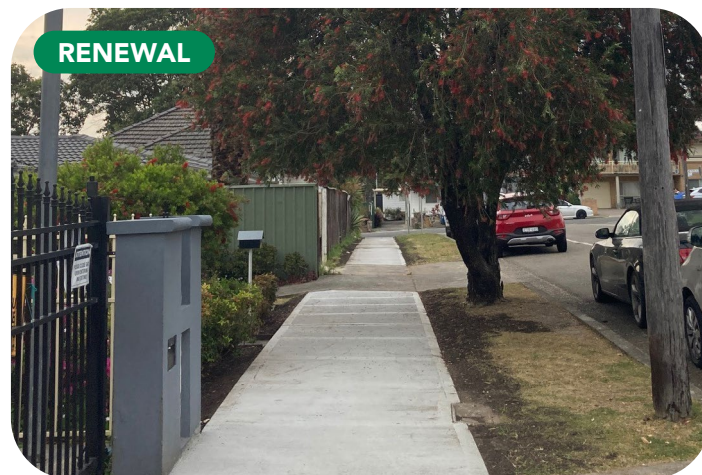
Albert Road, Auburn