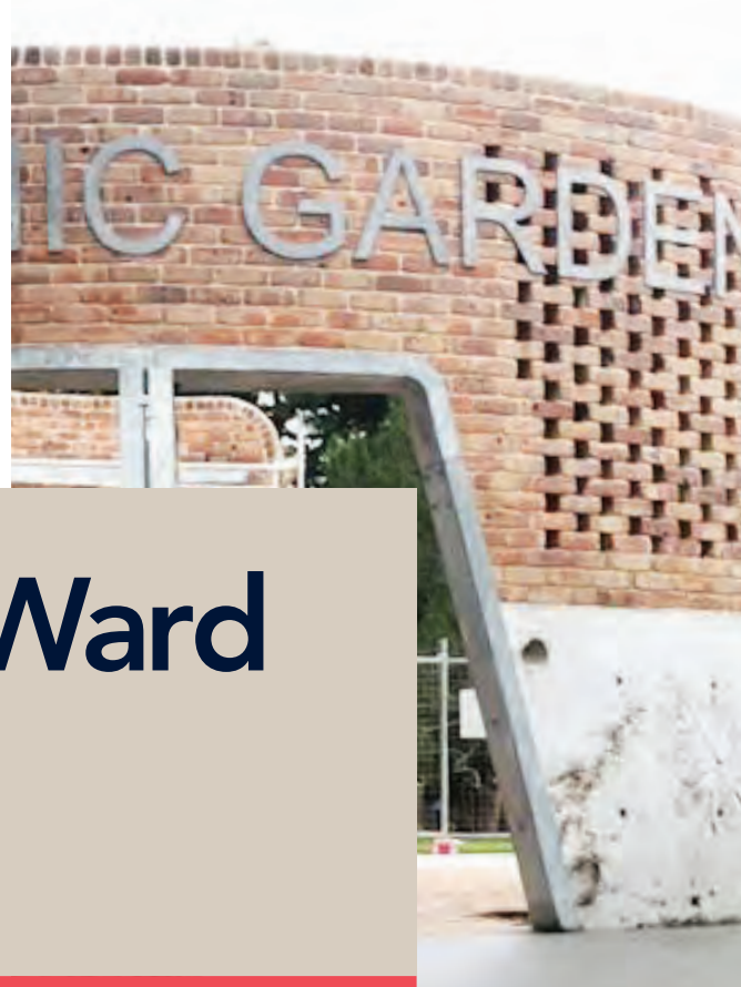
Auburn Botanic Gardens Entrance, P2