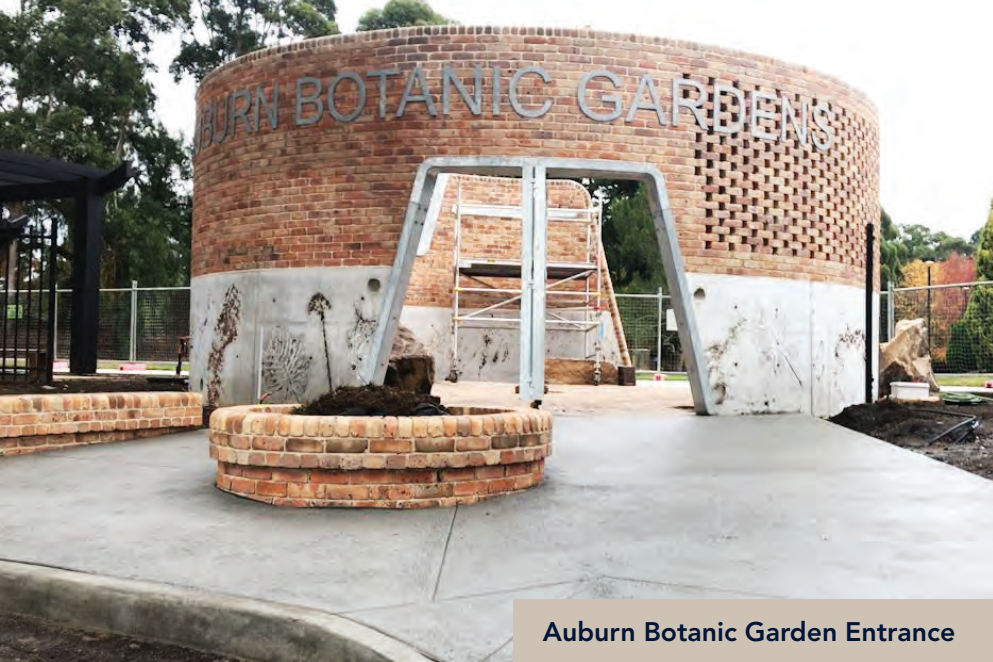
Auburn Botanic Garden Entrance