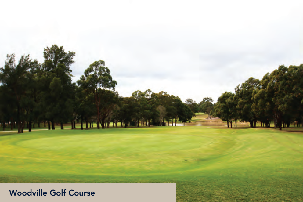
Woodville Golf Course

The project was funded by the NSW Government Stronger Communities Fund and the Everyone Can Play Grant Programme.