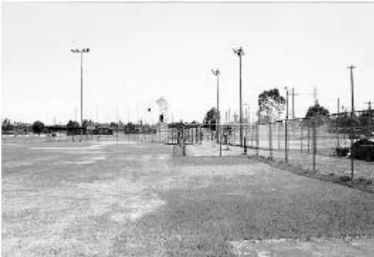
View of baseball diamond on Guildford West Sportsground