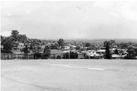
Typical Sportsground facility in Holroyd LGA

This document was placed on public display for a period of 42 days to provide interested parties with an opportunity to comment on the Draft Plan of Management. Comments received were considered by Council and the final document adopted without amendments being required.