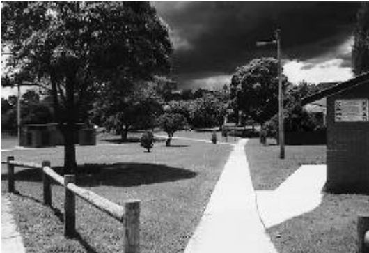
Pedestrian access through M.J. Bennett Sportsground