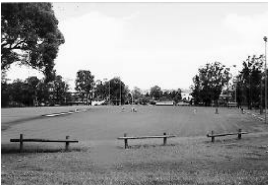
Nemesia Street Park in Greystanes

The main objective of this Plan of Management (POM) is to guide the future management and development of the various Sportsgrounds listed in the Schedule and located throughout the Holroyd City Council Local Government Area (LGA), taking account of community expectations and the resources available to Council.