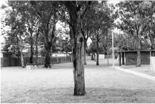
Remnant trees in Girraween Park in Toongabbie

These resources are under threat of being lost through a combination of factors including: