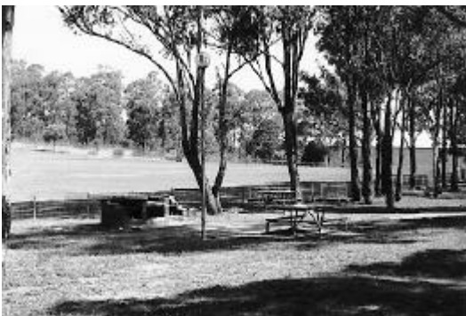
Picnic and BBQ facilities at Alpha Street Park in Greystanes