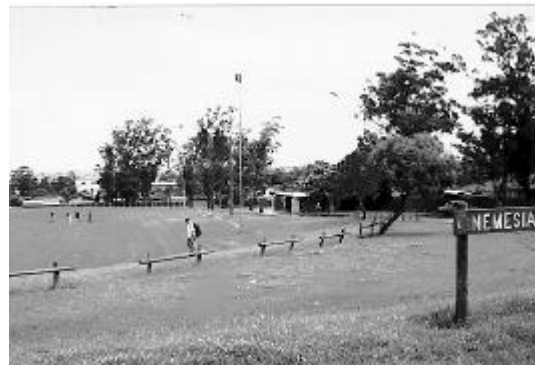
Sportsgrounds are used by a variety of user groups

In addition, the Sportsgrounds are used by individuals including adjoining residents for a diverse range of active and passive recreation activities.