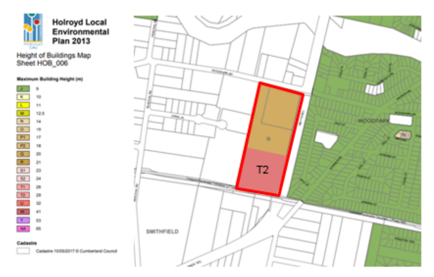
Figure 12 Proposed Amendment to Map Sheet HOB 006

The intended outcome of this Planning Proposal is to enable the redevelopment of the subject site to realise a high-quality mixed-use development that: