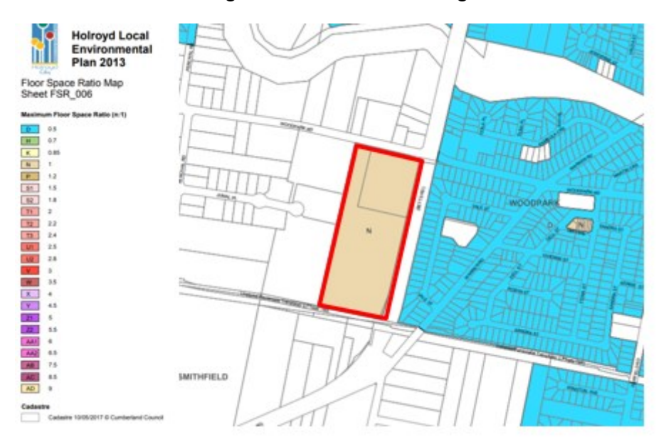
Figure 9 Floor Space Ratio