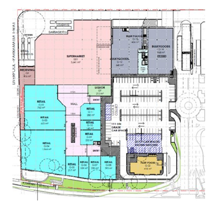
Figure 7. Southern Portion of Site Subject to Stage 3 Redevelopment