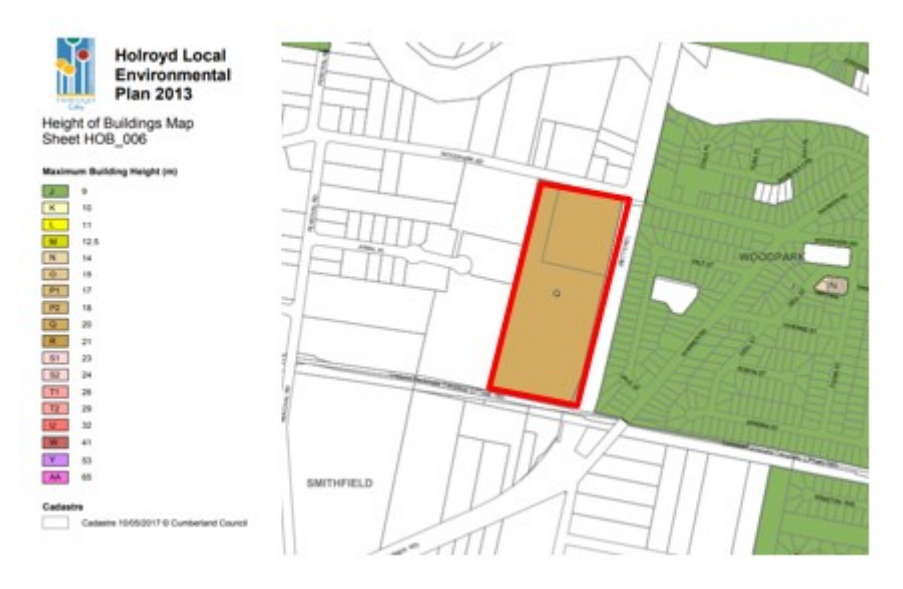
Figure 10 Height of Buildings