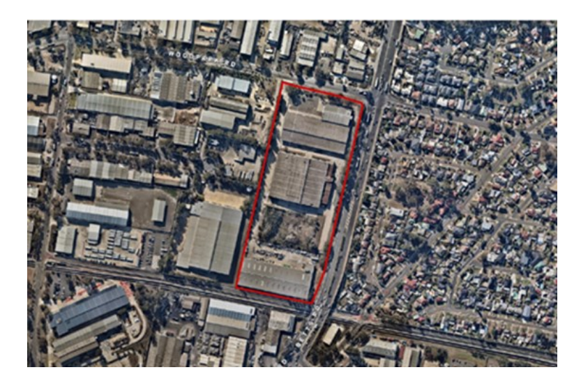
Figure 2 The Site

The subject site (the site) is located at 106-128 Woodpark Road, Smithfield. The overall site is rectangular in shape, and has a total site area of 67,478m2. The site has a 165m frontage onto Woodpark Road and a 405m frontage onto Cumberland Highway (Betts Road). The dedicated Parramatta to Liverpool Bus Transitway also adjoins the southern boundary of the site. The entire site slopes downwards towards to the southern boundary.