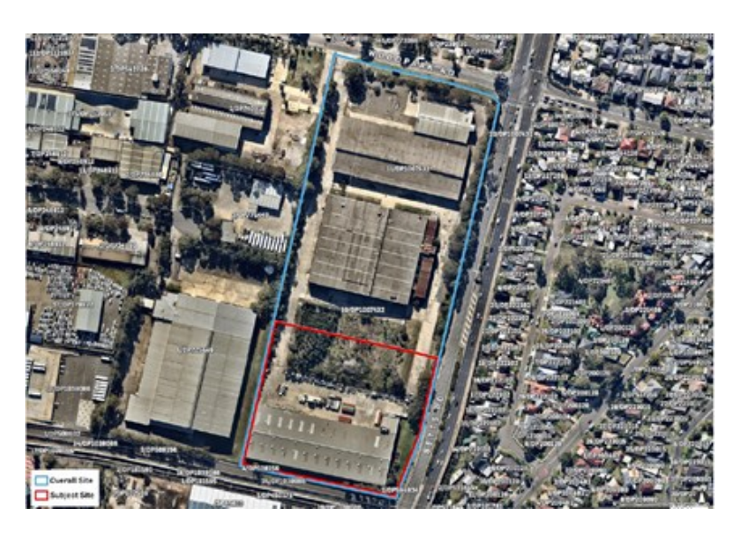
Figure 3 Portion of the Site Subject to Development Consents (Stages 1 and 2)

The overall site currently accommodates four large industrial buildings and associated structures. Vehicular access is provided via a dedicated driveway off Woodpark Road. The land is subject to recent development consents for the northern part of the site for specialised retail premises, childcare centre, medical centre and fast food premises.