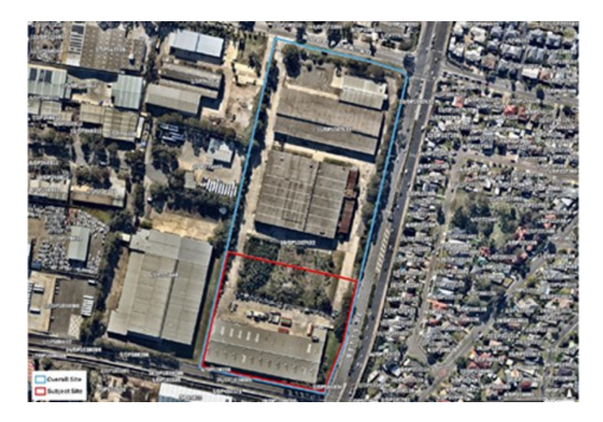
Figure 5. Southern Portion of Site Subject to Stage 3 Redevelopment

A future development application for the redevelopment of the southern portion of the site is proposed to include offices and traditional retail development.