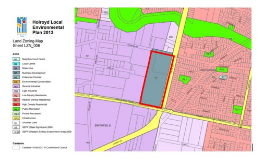
Figure 8 Land Use Zoning

The site is currently zoned B5 Business Development, with an FSR of 1.0:1 and Maximum Height of Building control of 20m apply across the site.