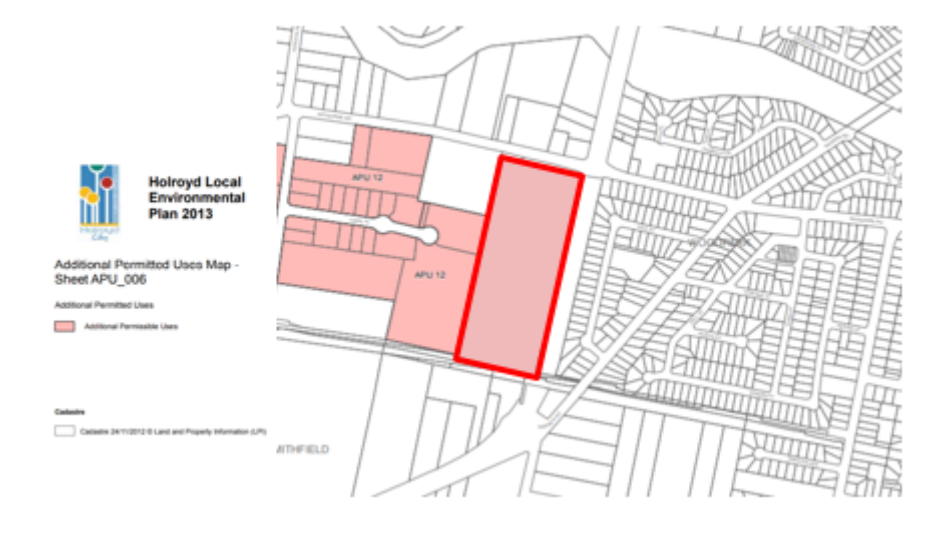
Figure 11 Proposed Amendment to Map Sheet APU 006