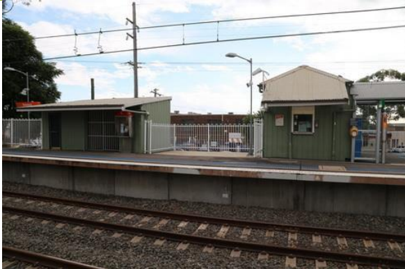
View to Platform 1 station elements