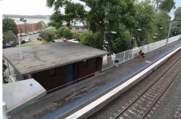
View southeast from footbridge to Platform 1.