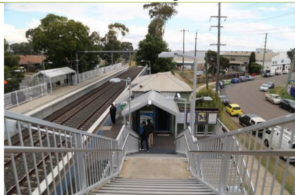
View northeast from Footbridge to Platform 1.