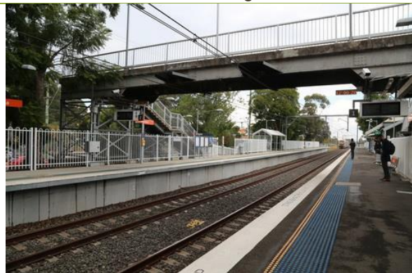
View of footbridge from Platform 2.