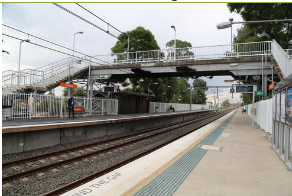
View from Platform 2 southeast to Platform 1.